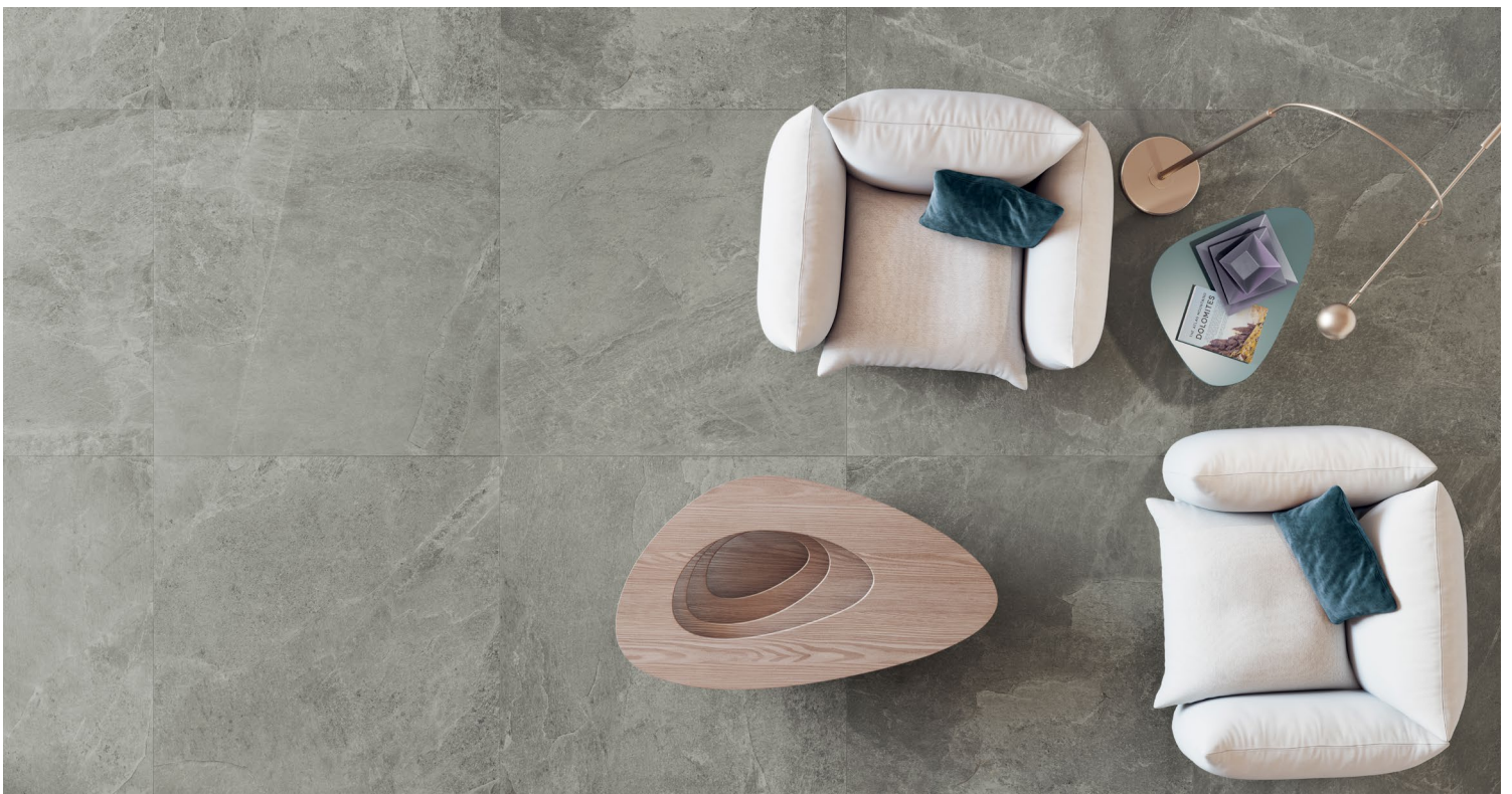
COAST (Light Grey)